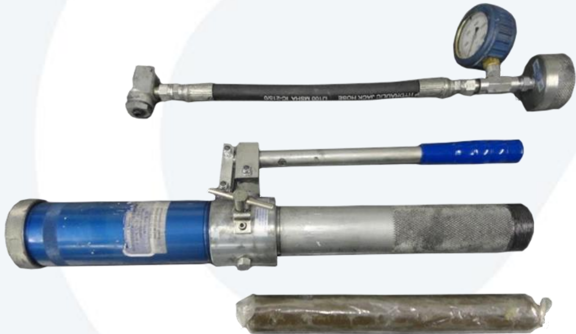
Hydraulic Hand Gun with barrel / chamber sized for a Stick Sealant (K size)